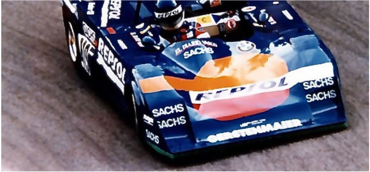
1979 Lola T298 BMW