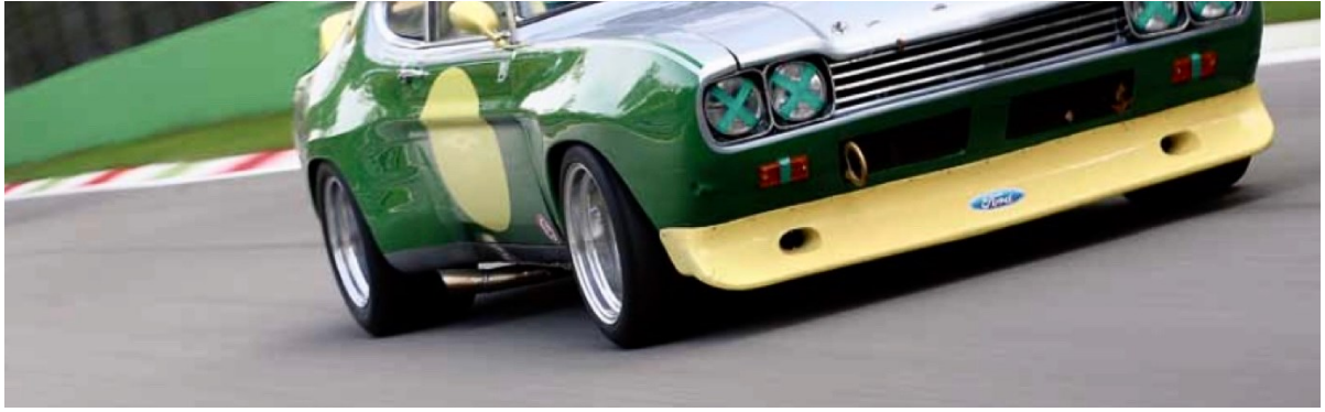
1972 Ford Capri RS2600 Group 2 (Ford Italia)