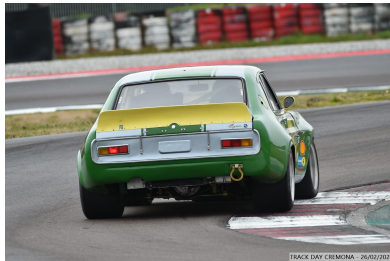
TRACK DAY CREMONA - 26/02/2022