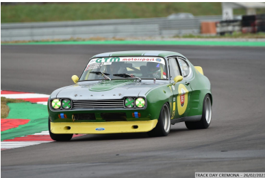
TRACK DAY CREMONA - 26/02/2022