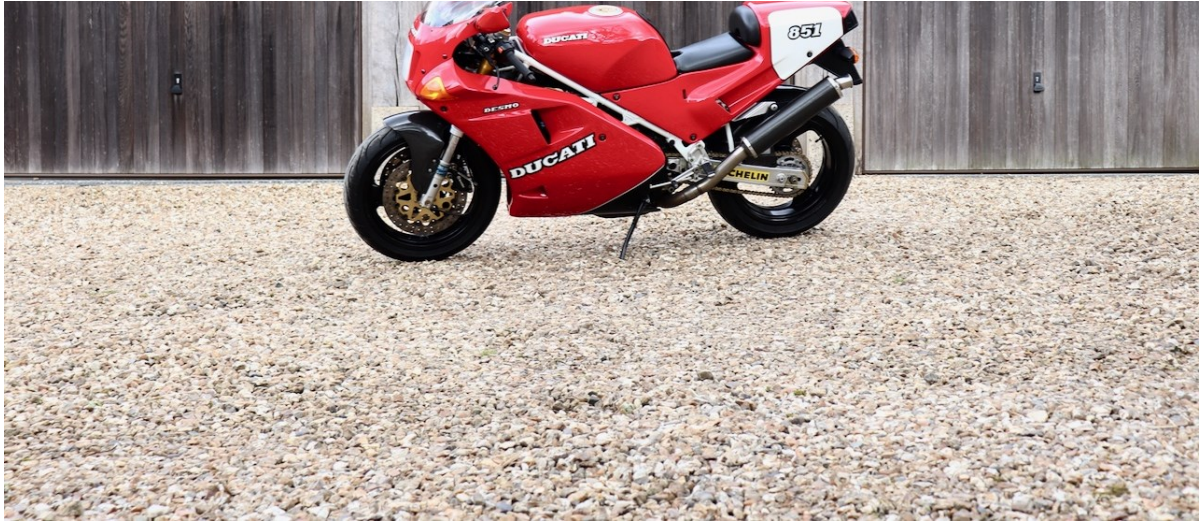
1991 Ducati 851 SP3 Sold