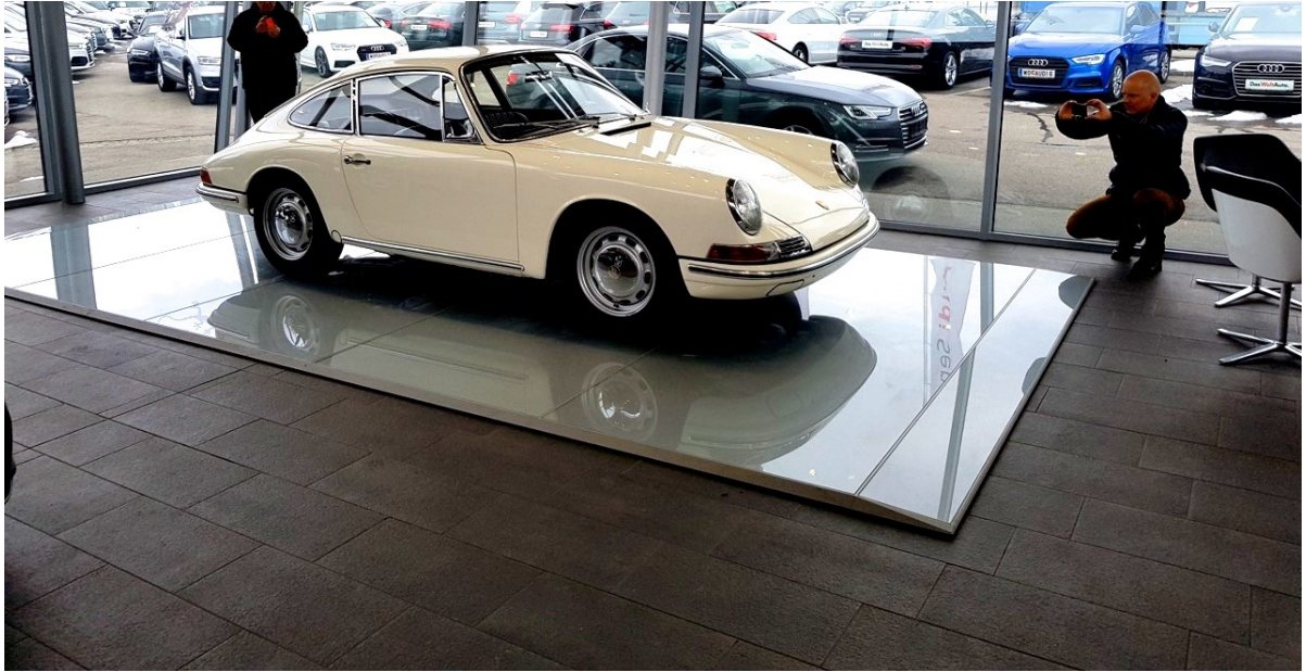
1966 Porsche 911